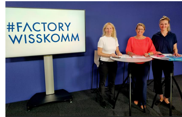
Session 7, September 2024