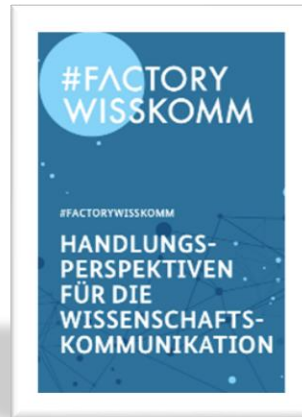
2020/21: Action Perspectives