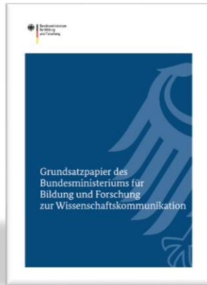
2019: Policy Paper