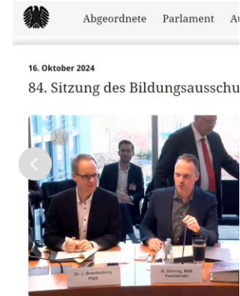
2024: Parliamentary initiative